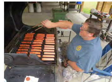
“The Grill Master”