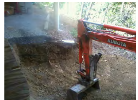
Darren Robinette from Robinette Excavating doing work at Morningside Range to facilitate retaining wall and concrete pad.