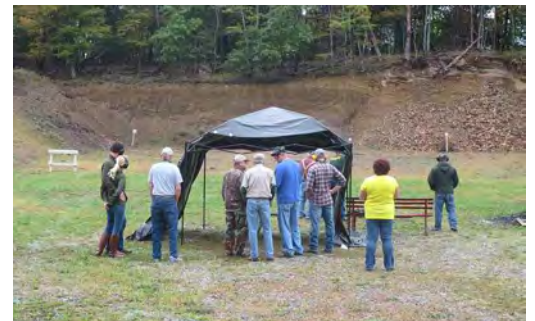
A group of shooting enthusiasts enjoying the Lever Action match at the Rendezvous, Morning Side Range.